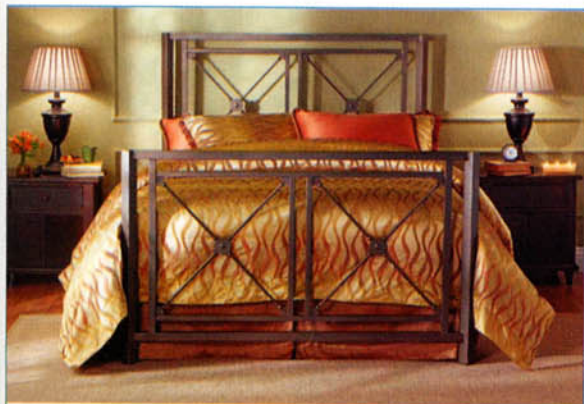
WESLEY ALLEN 877•523•2337