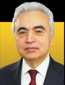
Dr. Fatih Birol