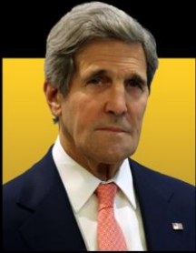
H.E John Kerry

US Special Presidential Envoy for Climate (TBC)