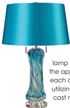
The Vergato table lamp showcases a soft spiral of sparkling clear hand-blown glass infused with a juiced teal tincture.