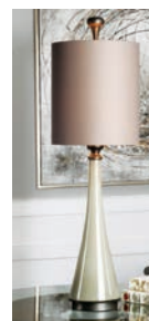
Arona table lamp has tapered, subtly seeded Ash Gray glass accented with oxidized, bronze-plated iron details. The round hardback drum shade is a chocolate gray linen.