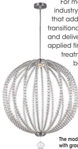
The modern, oversized orb of the Oberlin pendant by Feiss is dramatically adorned with graduated clear Rondure beads and finished with a larger clear Rondure accent.

"It recognizes the work our designers, engineers and all our employees continually do to enrich the Feiss brand, and similarly, the hard work of our sales reps and customers who successfully sell Feiss products. It's especially meaningful to us because the nomination comes from our peers in the industry."