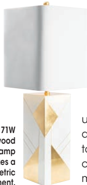
CTTL4171W Hollywood table lamp makes a geometric statement.

In business since 1987, Visual Comfort & Co. has produced a broad assortment of lighting, many with influential names in design attached to them. Using natural materials and distinctive hand-applied, living finishes, Visual Comfort feels that quality lighting is expressive and should be well-suited to the customer's wanted environment. The company has been honored with multiple ARTS Awards and nominations.