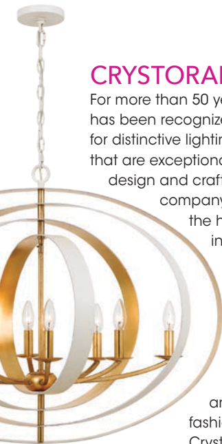
Industrial style fuses with modern sophistication in the company's popular Luna Collection.