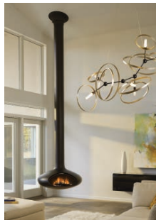
The Celesse pendant can be personalized with a choice of Soft Gold or Vintage Platinum finish on the aluminum rings.